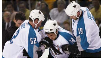
A pair of Sharks players help a teammate off the ice.